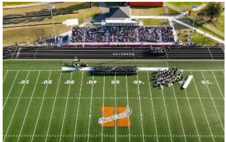
Graduation 2023

High School Band & Choir- Earned All "1's" at Regional Festival